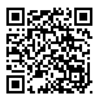
Smart phone quick response code to online registration.

Register by April 13, 2011, to receive the early-bird discount and save $80! After May 6, 2011, bring the form to the registration desk at the Minneapolis Convention Center for onsite registration.