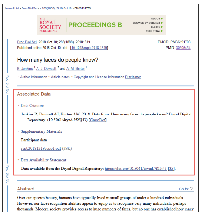
The Associated Data box on the PMC record.

PMC is also a valuable data resource for researchers doing large-scale analyses of scientific texts. In 2018, the number of articles available in the PMC Text Mining Collections surpassed 2 million. Through these collections, scientists are able to analyze the text of open access and papers resulting from publicly-funded research and further apply the findings of NIH-funded and other research to generate new discoveries.