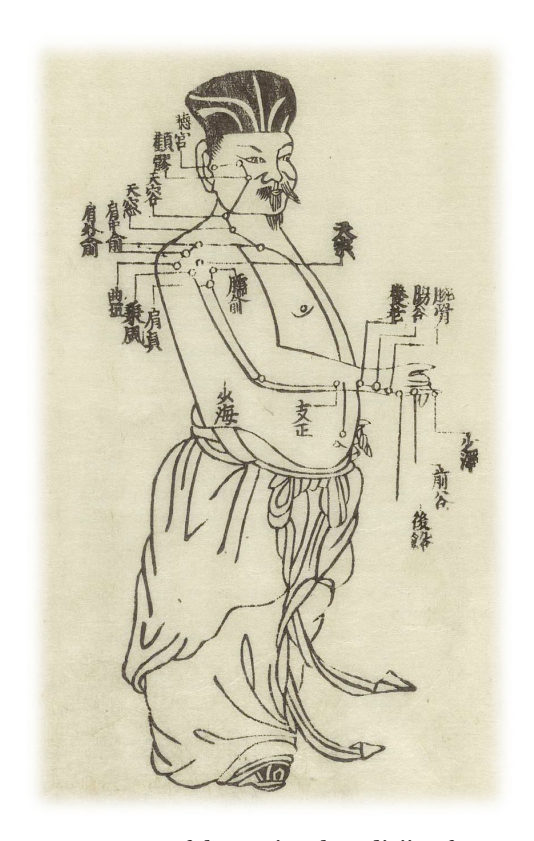
Courtesty of the National Mediciine from Shou Hua's Jushikei hakki , 1776.