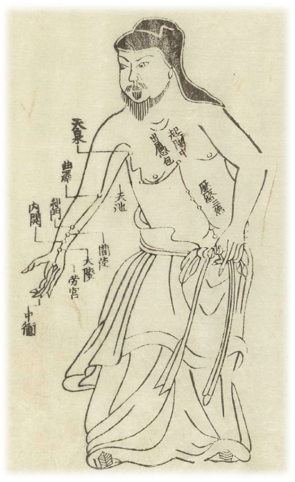
Courtesty of the National Mediciine from Shou Hua's Jushikei hakki , 1776.