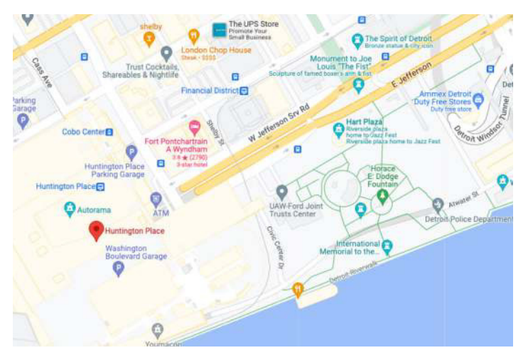
Location courtesy of Google Maps