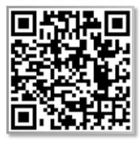
Quick response code to online reservations.

Single/Double: $209 (plus tax) Triple: $229 (plus tax) Quad: $249 (plus tax)