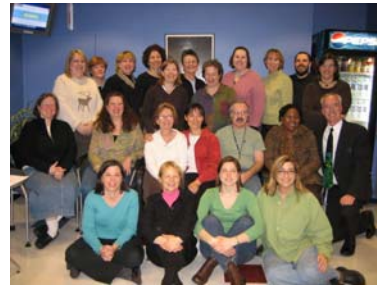
MLA CE Institute Scholars, March 2006